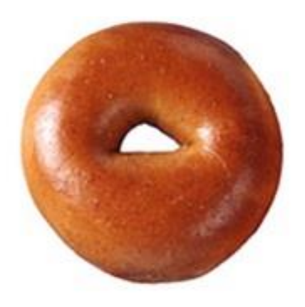
5-6-inch diameter 350 calories