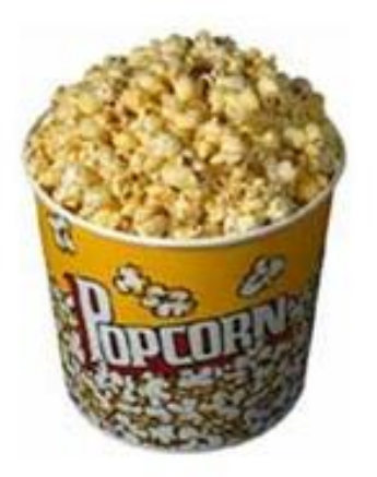
Tub 630 calories